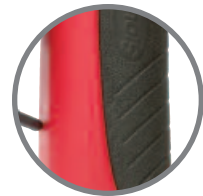
Ergonomic, composite handle with textured soft grip