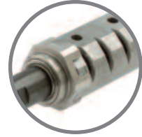
1 HP motor