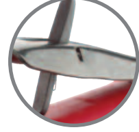
Contoured throttle lever with lock