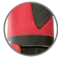
Light weight aluminum reinforced nylon housing

Through industry research and operator input, we have engineered a program that truly delivers tools for the way you work!